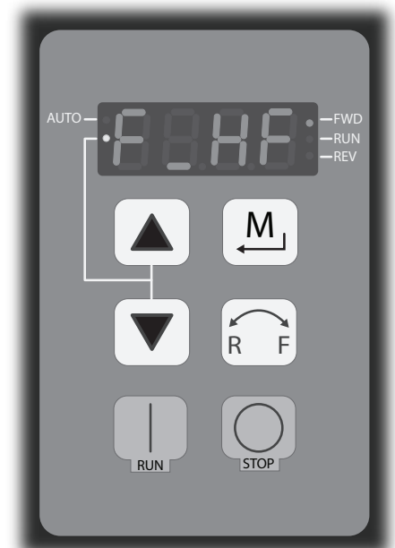
Typical fault message display (incoming line over-voltage shown)