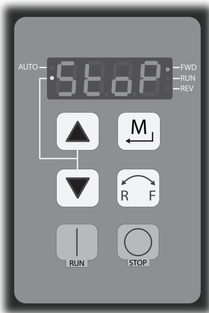
Drive idle/stopped screen