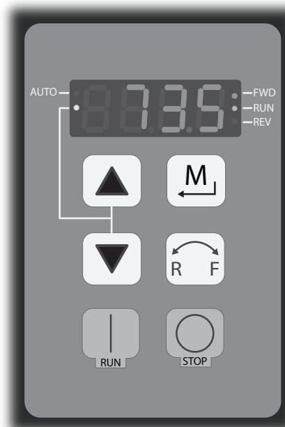
Fan speed percentage display (73.5% running forward)